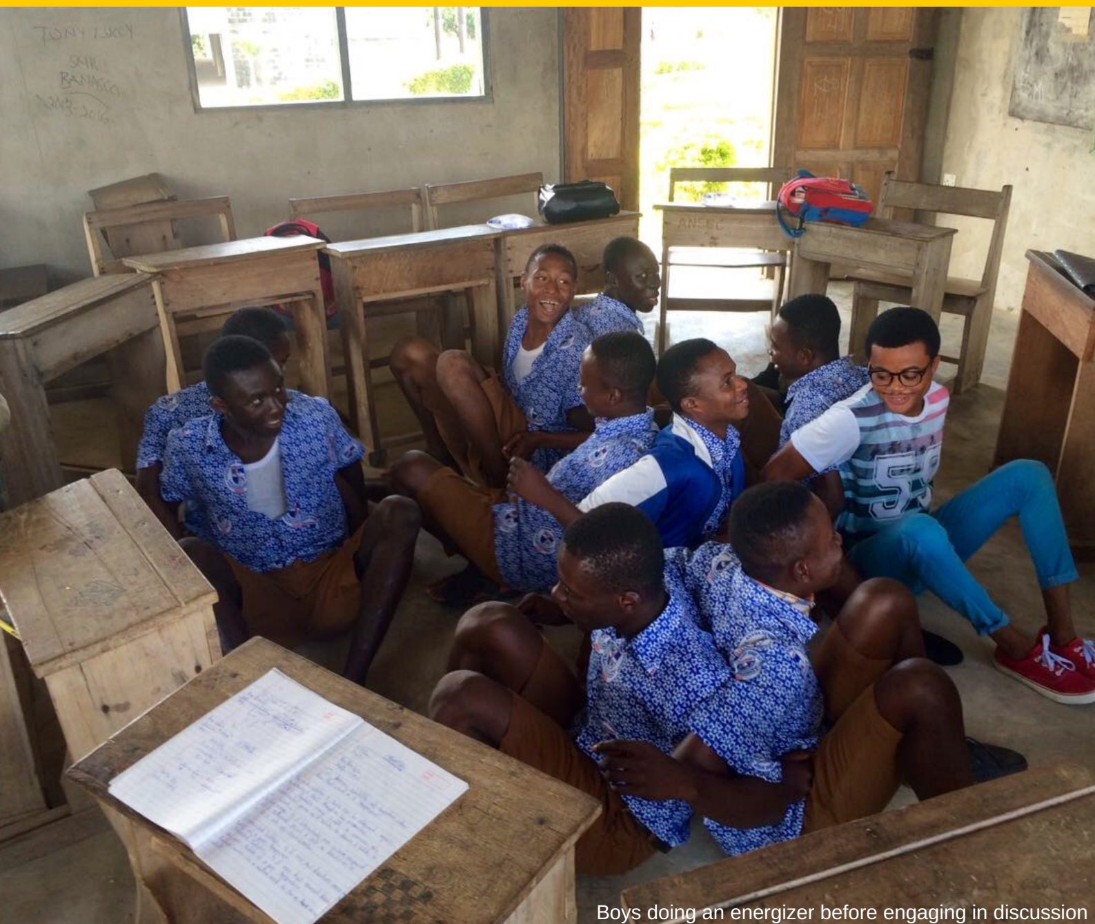
Boys doing an energizer before engaging in discussion

We ran our pilot program in Term 1 of the 2016/17 school year at Antoa SHS. The program had a total of 13 participants and it was received very positively. Due to this success, we have implemented another BPC Program at Asanteman SHS, beginning January 2017 to complement the Girls LEAP already in session at that school.