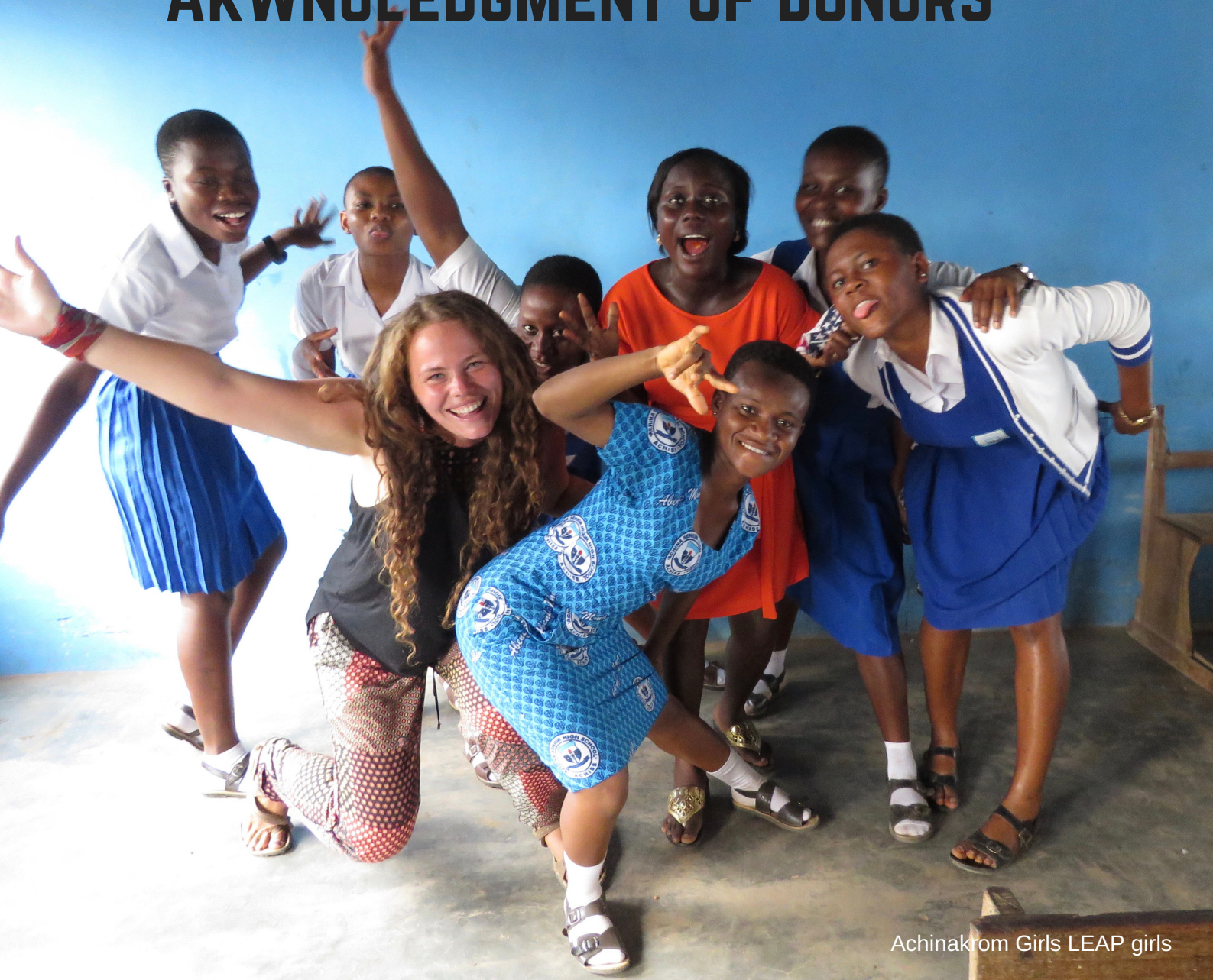
Achinakrom Girls LEAP girls

Exponential Education could not exist without its generous donors. In 2016 we did a number of creative fundraising events which included: