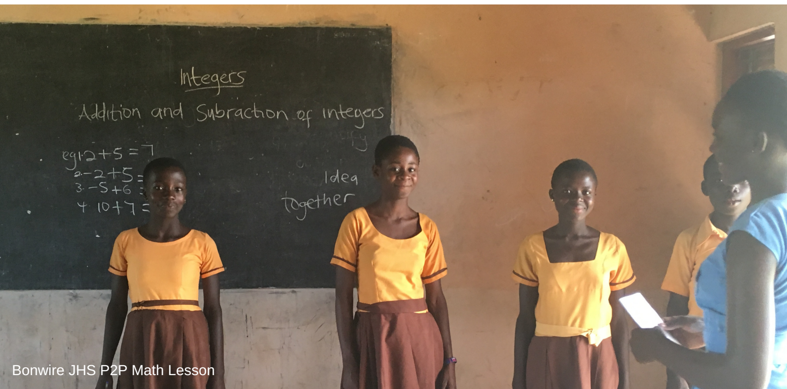
Bonwire JHS P2P Math Lesson

Exponential Education is always open to future proposals and partnerships. Current staff and volunteers eagerly anticipate the upcoming term and school year working in Ghana.