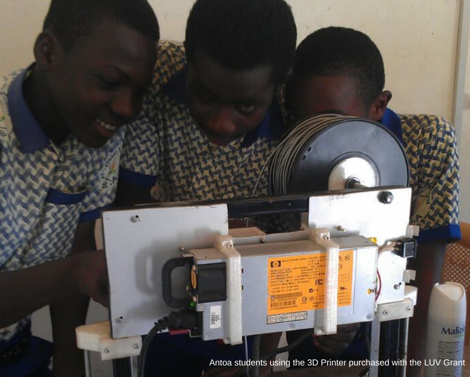
Antoa students using the 3D Printer purchased with the LUV Grant