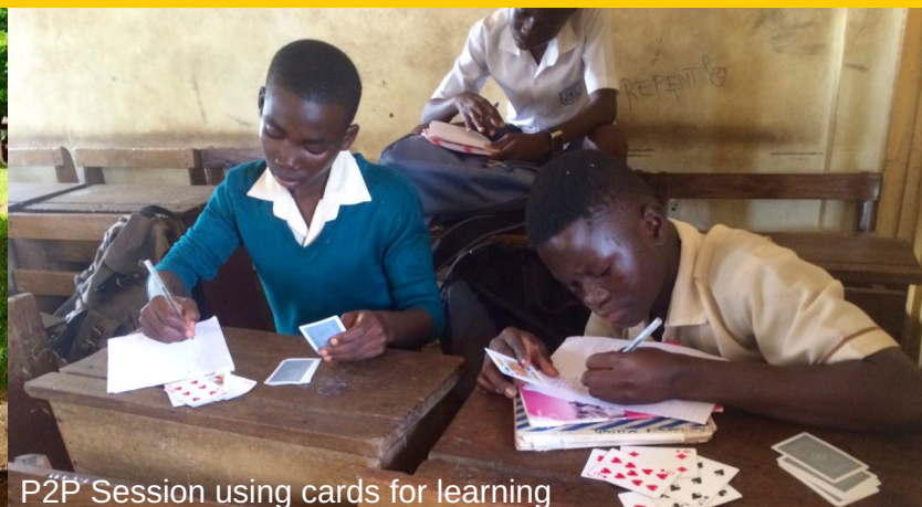
P2P Session using cards for learning