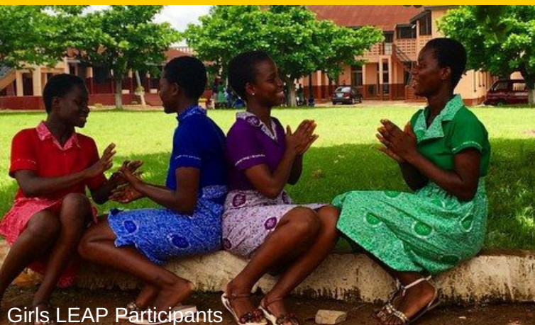
Girls LEAP Participants