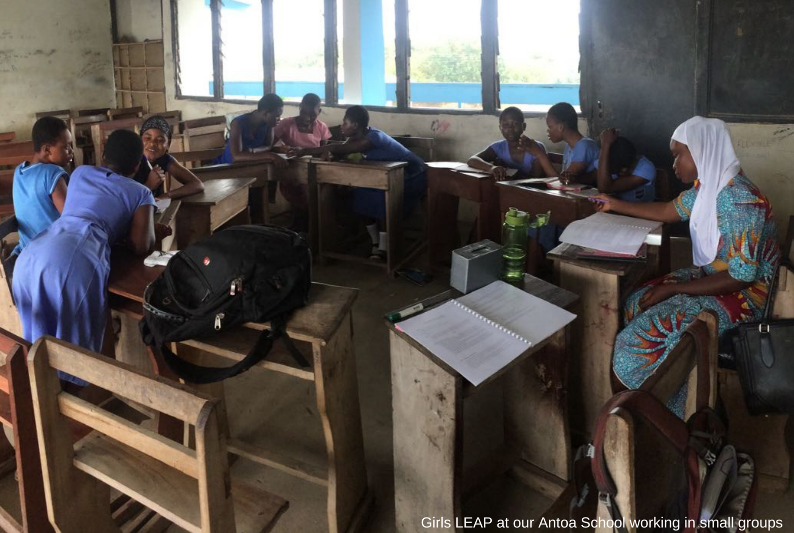
Girls LEAP at our Antoa School working in small groups